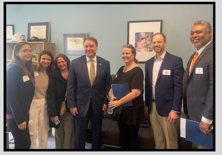
REPRESENTATIVES FROM HOME CARE ASSOCIATION OF AMERICA