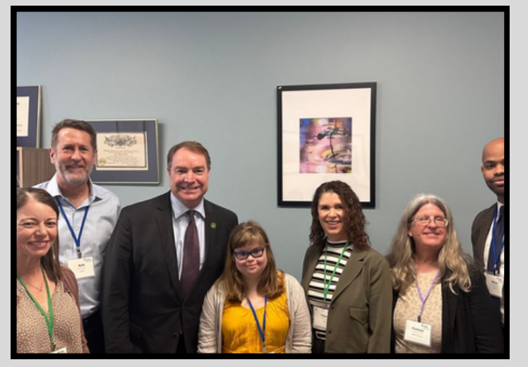
REPRESENTATIVES OF CA DISABILITY SERVICES ORGANIZATION