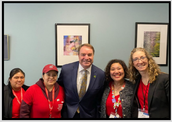
PARENT AND STAFF LEADERS FROM COMMUNITY ACTION MARIN ON THEIR HEAD START ADVOCACY DAY

While I am out in Sacramento during the week, I greatly value my time meeting with diverse organizations that are pushing initiatives that are beneficial to our community in the North Bay. It's especially exciting when I have the opportunity to meet with constituents from AD12 lobbying out in Sacramento! Here are some snapshots of some of the meetings and events my Capitol office participated in over the past month. As always, our door is open, if you want to schedule a meeting or send an event invite, please reach out through our website by clicking <u>here</u>.