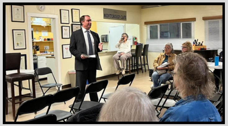
LEGISLATIVE UPDATE WITH THE DEMOCRATIC CLUB OF SOUTHERN SONOMA COUNTY