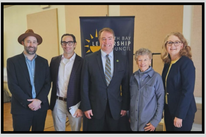
DISCUSSED LEGISLATIVE PRIORITIES WITH NORTH BAY LEADERSHIP COUNCIL