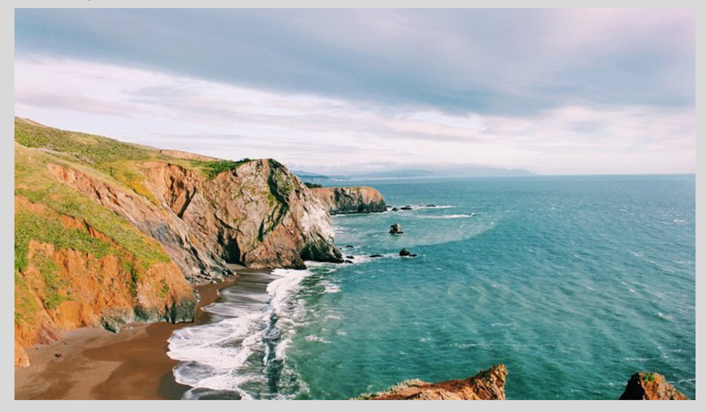
Damon Connolly Assemblymember, 12th District