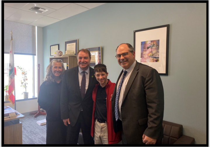
REPRESENTATIVES AND AN ATHLETE LEADER FROM SPECIAL OLYMPICS NORTHERN CALIFORNIA