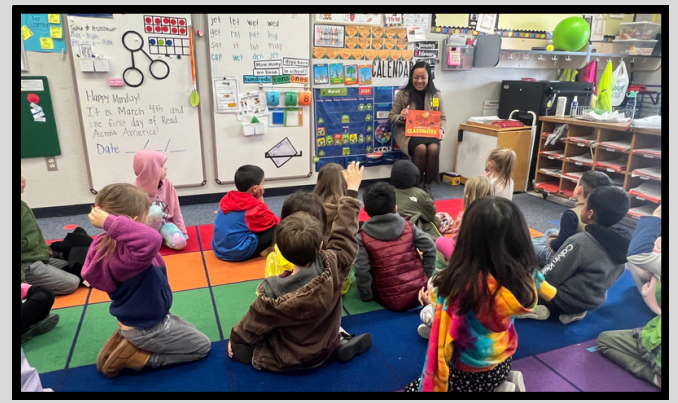
CELEBRATING READ ACROSS AMERICA WEEK WITH AD12 ELEMENTARY STUDENTS