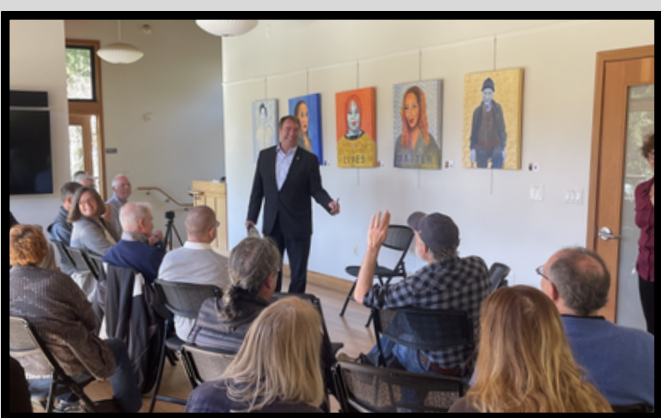
LEGISLATIVE UPDATE AT CITIZEN MARIN MEETING