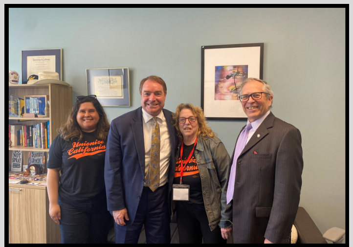
REPRESENTATIVES FROM UNIONIZE CALIFORNIA