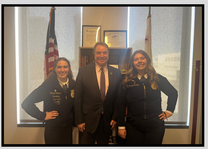
DISCUSSED EDUCATION AND AGRICULTURE IN AD12 WITH HIGH SCHOOL STUDENTS FROM PETALUMA REPRESENTING FUTURE FARMERS OF AMERICA